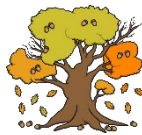
leaves and fruit falling